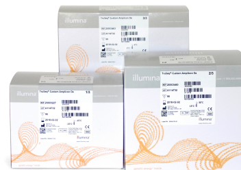
Figure 1: TruSeq Custom Amplicon Kit Dx —The FDA-regulated, CE-IVD–marked TruSeq Custom Amplicon Kit Dx provides library preparation reagents that allow clinical laboratories to develop their own diagnostic tests intended for use on Illumina Dx sequencing instruments.