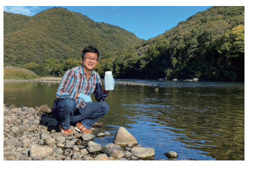
Field research in Okayama Prefecture. "The fun part of this research is that we can go to many places in search of water."

Illumina Special Page of Environmental DNA Analysis: https://www.illumina.com/destination/edna.html