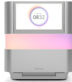
Figure 2: NextSeq 1000 and NextSeq 2000 Sequencing Systems—The NextSeq 1000 and NextSeq 2000 systems harness the latest advances in SBS chemistry and streamline sequencing workflows.